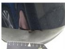
Bonnet, Chemical polution, LI - Repair and paint (complete)