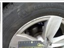
Wing R R, Dent(s) and scratch(es), LI - Repair and paint (complete)