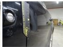
Wing R L, Chemical polution, LI - Repair and paint (complete)