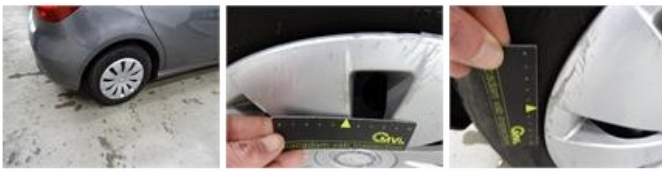
Wheel cover F L, Scratch(es), E - Replace