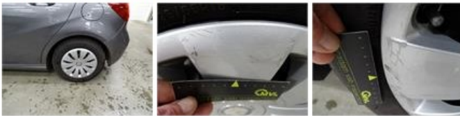
Bumper R, Scratch(es), LI - Repair and paint (complete)