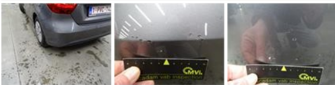
Bumper F, Dent(s), LI - Repair and paint (complete)