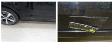
Wing R R, Dent(s), It - Spot repair