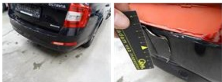
Rearlight R , Crack, E - Replace