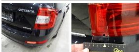
Reflector, Scratch(es), E - Replace