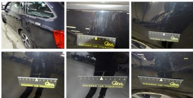
Door R R, Scratch(es), LI - Repair and paint (complete)