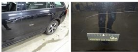
Rear window, Scratch(es), E - Replace