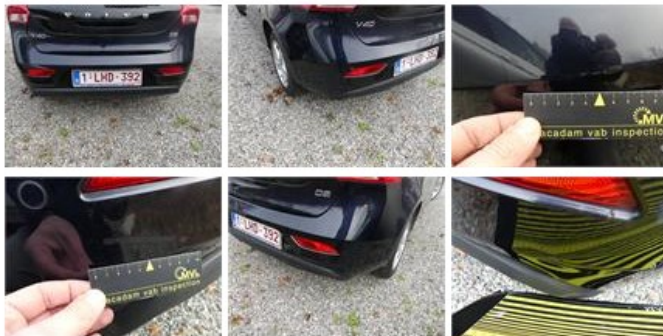
Wing F L, Scratch(es), Acceptable