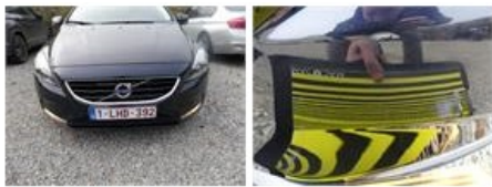
Rearview mirror housing R, Scratch(es), Acceptable