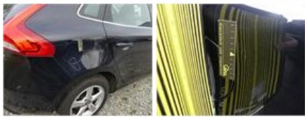
Maintenance, Maintenance, P - Check