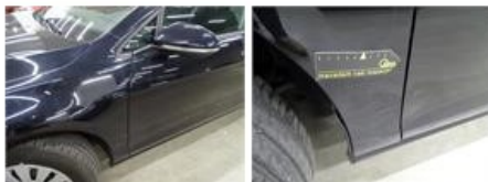
Rearview mirror housing R, Scratch(es), Acceptable