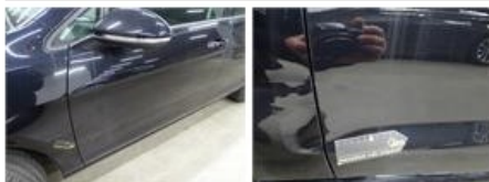
Door R R, Scratch(es), LI - Repair and paint (complete)