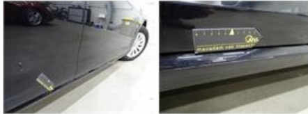
Wing F L, Dent(s), LI - Repair and paint (complete)