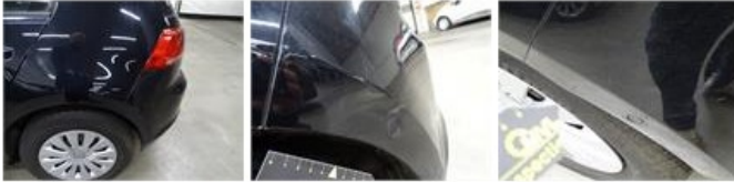
Wing F R, Scratch(es), LI - Repair and paint (complete)