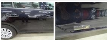
Wing R L, Dent(s) and scratch(es), LI - Repair and paint (complete)