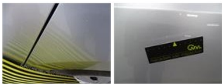
Backrest cover F L, Worn, E - Replace