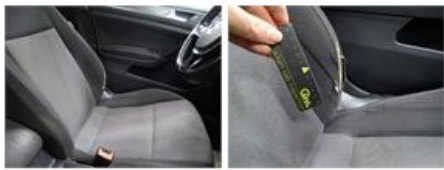
Seat cover F L, Worn, E - Replace