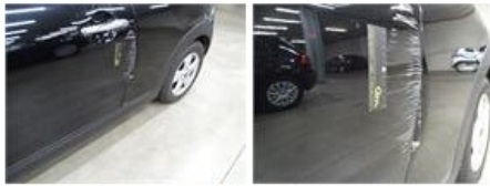
Wheel arch cover R R, Scratch(es), E - Replace