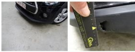
Bonnet, Chemical polution, LI - Repair and paint (complete)