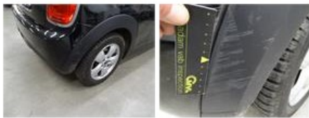
Wheel arch cover R L, Scratch(es), E - Replace