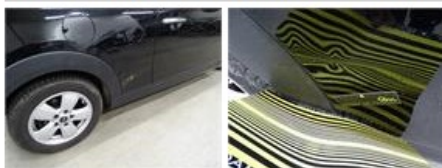
Wing R L, Dent(s) and scratch(es), LI - Repair and paint (complete)