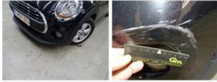
Door F L, Dent(s) and scratch(es), LI - Repair and paint (complete)