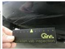
Door R L, Bad repair, LI - Repair and paint (complete)