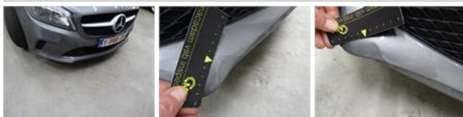
Wing F L, Dent(s), PDR - Paintless dent repair