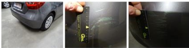
Wheel cover F R, Scratch(es), E - Replace