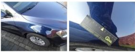
Wheel cover F R, Scratch(es), Acceptable