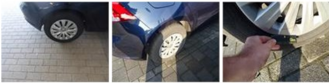
Trunk lid covering R, Scratch(es), Acceptable