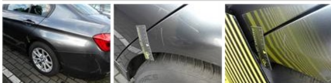
Alloy rim F R, Scratch(es), Acceptable