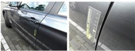
Door R R, Dent(s), Acceptable