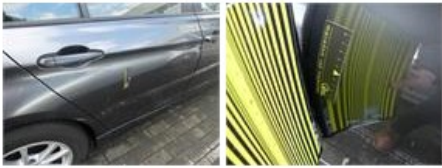
Wing R R, Dent(s), Acceptable