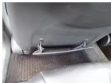
Door panel R L, Scratch(es), Smart repair