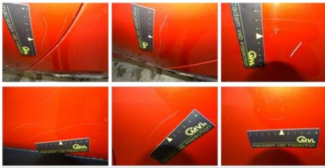
Wheel cover F L, Scratch(es), E - Replace