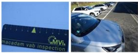
Roof, Dent(s), Acceptable