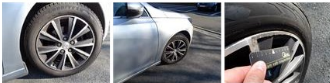
Door F L, Scratch(es), Acceptable