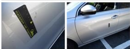
Sill outer R, Dent(s) and scratch(es), LI - Repair and paint (complete)