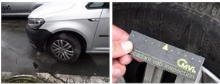
Bonnet, Stone chip(s), LI - Repair and paint (complete)