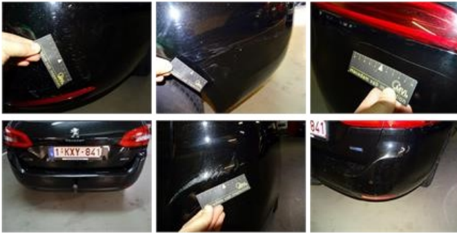
Wing R L, Dent(s), PDR - Paintless dent repair