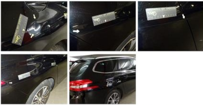
Rearview mirror housing R, Scratch(es), LI - Repair and paint (complete)