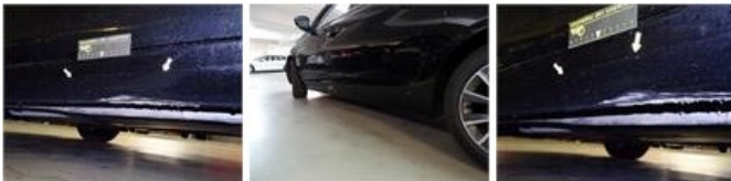
Alloy rim R R polished, Scratch(es), I - Repair