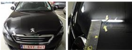
Wing F L, Scratch(es), Acceptable 0,00