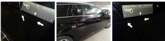
Rocker panel inner R R, Scratch(es), Acceptable 0,00