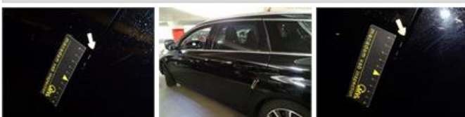
Wing R R, Dent(s) and scratch(es), LI - Repair and paint (complete) 308,20