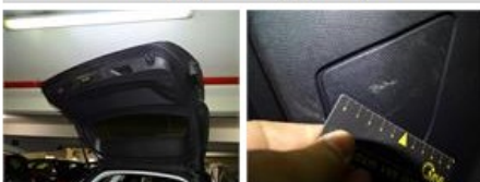
Door R L, Scratch(es), Acceptable 0,00