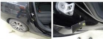
Trunk lid covering R, Scratch(es), Acceptable 0,00