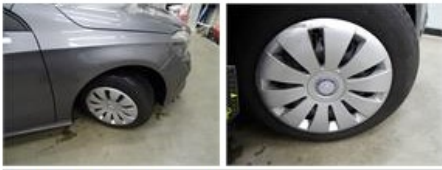
Bonnet, Repaired, Acceptable