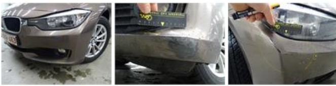
Bumper R, Dent(s) and scratch(es), LI - Repair and paint (complete)