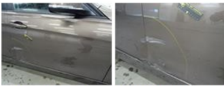
Sill outer R, Dent(s) and scratch(es), LI - Repair and paint (complete)