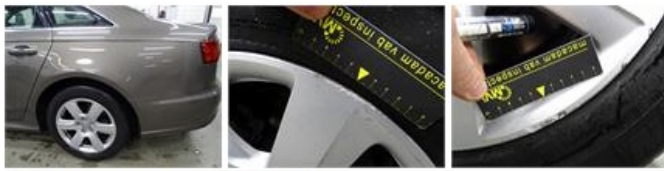
Alloy rim R R, Scratch(es), Acceptable