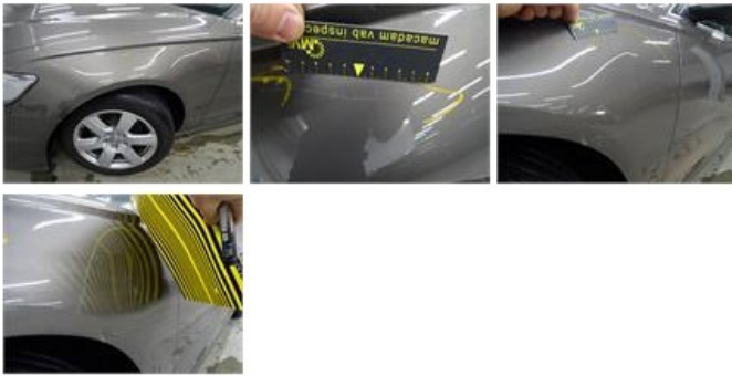
Door panel F L, Scratch(es), Smart repair