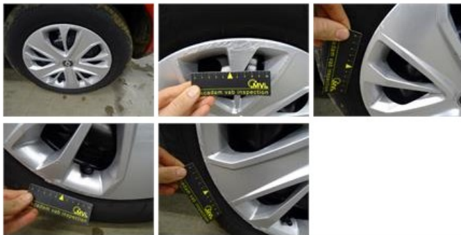
Wheel cover F L, Scratch(es), E - Replace