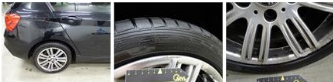
Maintenance, Maintenance, Execute