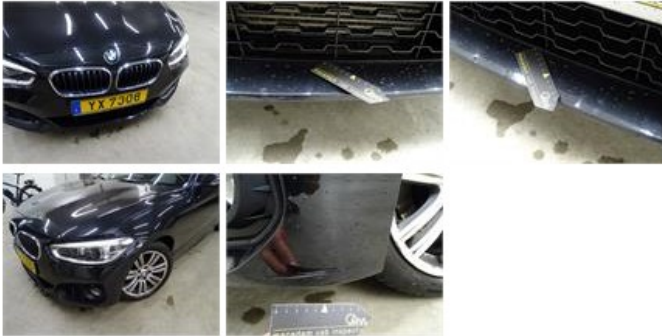
Door F R, Scratch(es), LI - Repair and paint (complete)