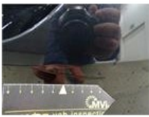
Alloy rim F R, Scratch(es), LI - Repair and paint (complete)