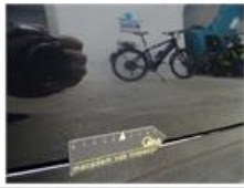
Bonnet, Scratch(es), LI - Repair and paint (complete)