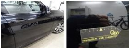
Sill outer R, Scratch(es), LI - Repair and paint (complete)