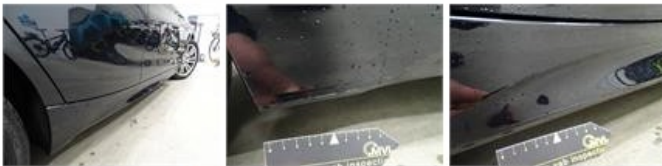
Door F L, Bad repair, LI - Repair and paint (complete)