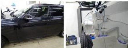
Alloy rim R R, Scratch(es), LI - Repair and paint (complete)