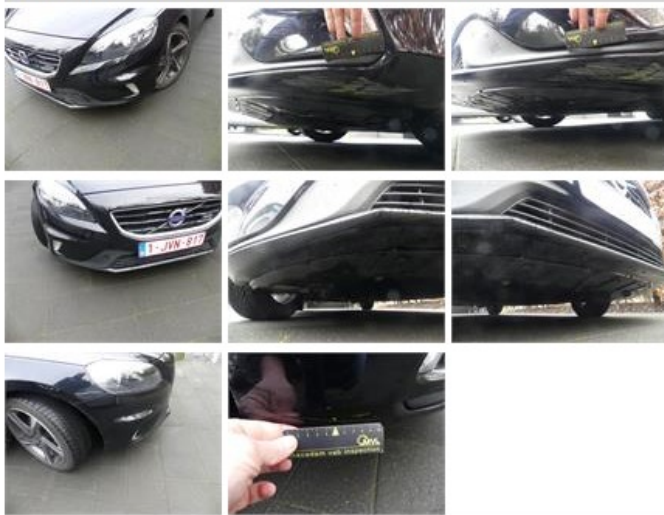
Alloy rim F L polished, Scratch(es), LI - Repair and paint (complete)