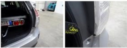
Rear window, Scratch(es), E - Replace