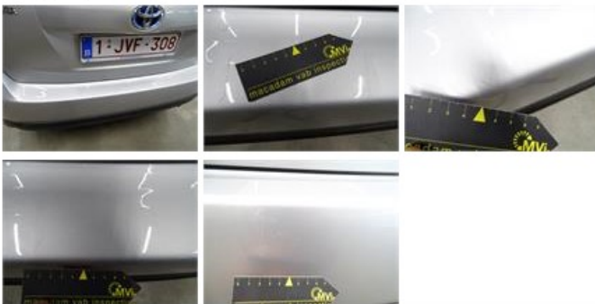
Wing R R, Scratch(es), Acceptable