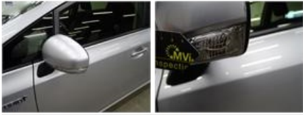
Door R L, Scratch(es), Acceptable