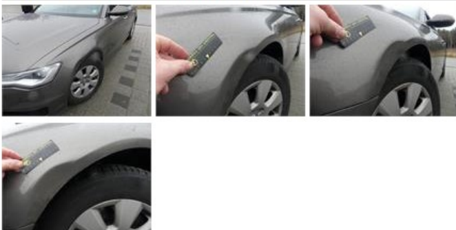
Wing F R, Scratch(es), It - Spot repair