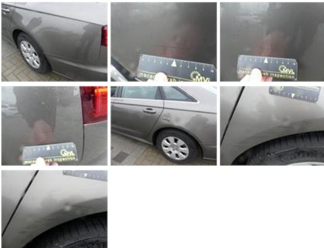
Bonnet, Stone chip(s), Acceptable