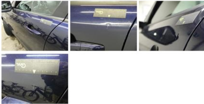
Door moulding Lower R R, Scratch(es), E - Replace