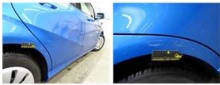
Door R R, Scratch(es), LI - Repair and paint (complete)