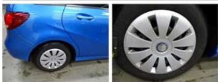
Wheel cover R L, Scratch(es), Acceptable