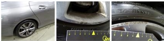
Alloy rim R L, Scratch(es), LI - Repair and paint (complete)