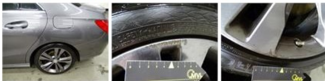
Wing R L, Repaired, Acceptable