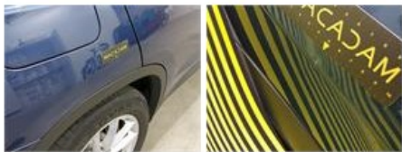
Door RL, Dent(s) and scratch(es), Repair and paint (complete)