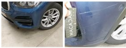
Bonnet, Scratch(es), Repair and paint (complete)