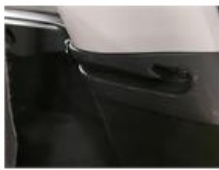
Door FL, Dent(s) and scratch(es), Repair and paint (complete)