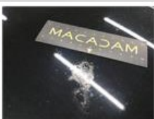
Bumper R, Scratch(es), Repair and paint (complete)