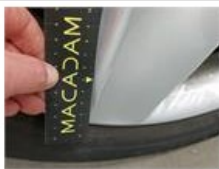
Wheel cover FL, Scratch(es), Acceptable