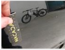
Door FR, Scratch(es), Acceptable