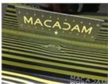
Door trim FR, Scratch(es), Acceptable